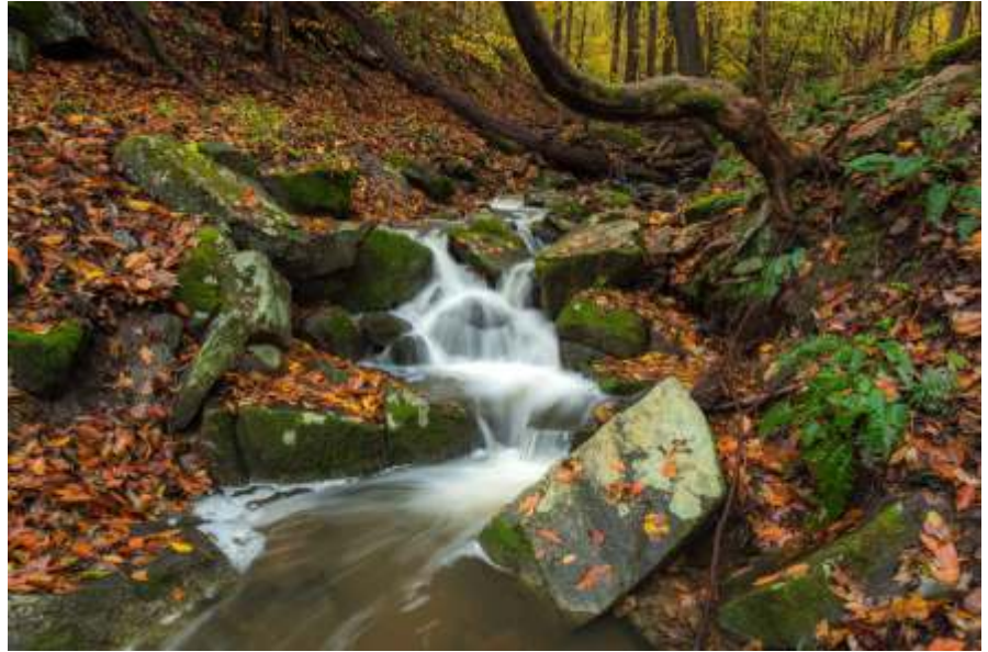
People's Choice Winner for PaSNAPsco 2019! "A Hidden Brook" by Emily Mitchell.

The natural environment of the Patapsco Valley Heritage Area is an asset unique among Maryland's Heritage Areas and one that we prize for both its recreational and intrinsic values. In 2020, PHG leaders, staff, and volunteers continued to make significant contributions to understand, preserve, and restore this wonderful natural asset. We hosted live interactive webinars on a variety of topics, including vernal pools, stream monitoring, native and invasive plants, and native wildlife in the Patapsco watershed. We provided a series of instructional videos on our social media platforms to help followers learn about nature, identify and remove invasive plants, and start their own backyard garden.