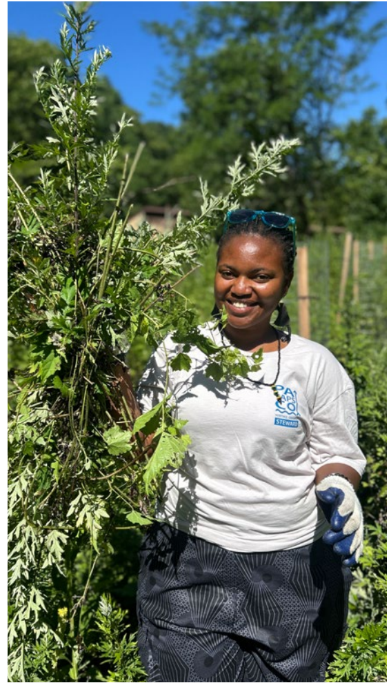
Left: Students at Church Lane Elementary and Technology School planted trees on the school grounds. Right: Young African Leadership Institute Fellows visited Patapsco Valley State Park for an educational, environmental and recreation event organized by PHG. ▲